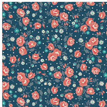
2140/B Ditzzy Floral