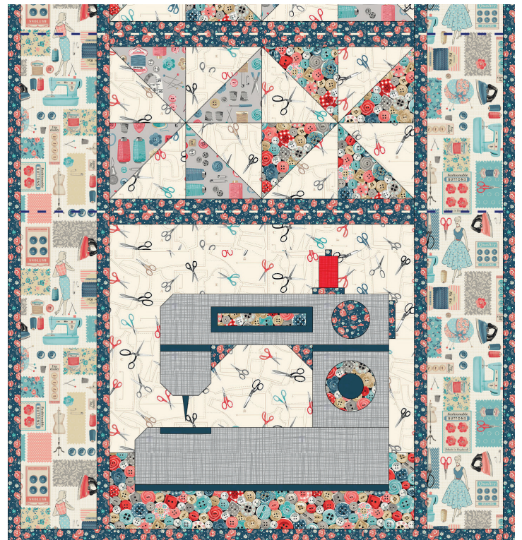
Sewing Machine throw cover by Lynne Goldsworthy of lilysquilts.blogspot.com Finished size 20" x 33" (50cm x 80cm) Download free from www.makoweruk.com