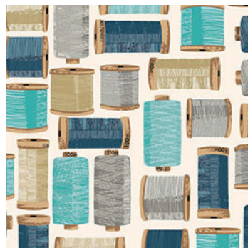
2139/B Cotton Reels