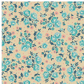
2140/Q Ditzzy Floral