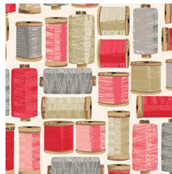
2139/P Cotton Reels