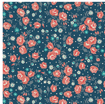
2140/B Ditzzy Floral