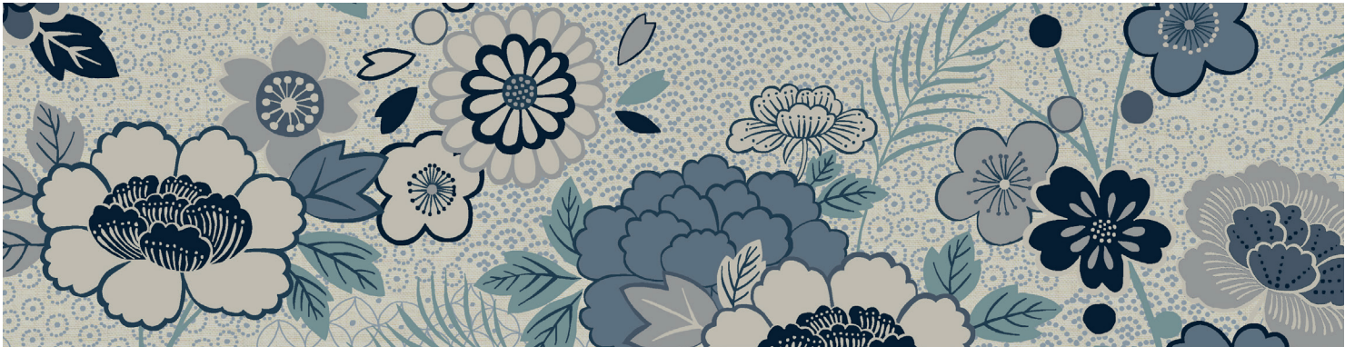
2150 LCQ Floral Montage