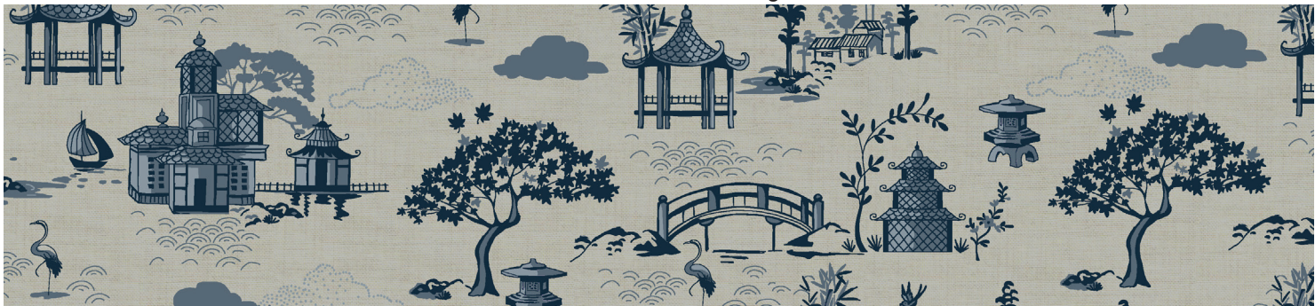
2153 LCQ Scene