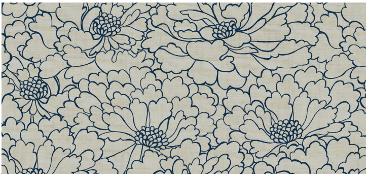
2154 LCQ Chrysanthemum