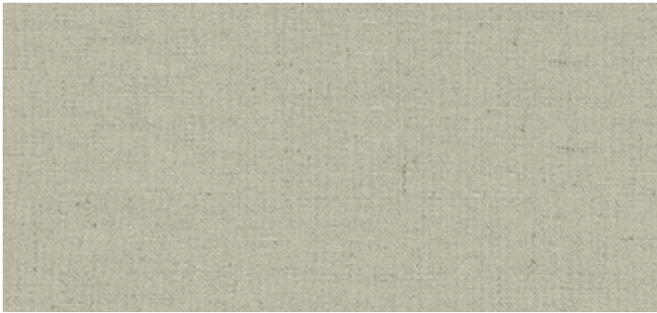
1000 LCN Natural

Width 112cms / 44" wide. Composition 55% Linen / 45% Cotton. Weight 243.06grams per m 2 , 57% heavier than regular cotton, 10m pieces only