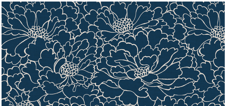
2154 LCB Chrysanthemum