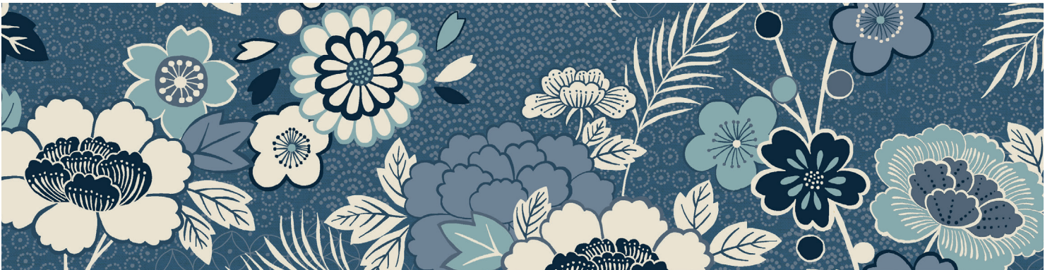
2150 LCB Floral Montage